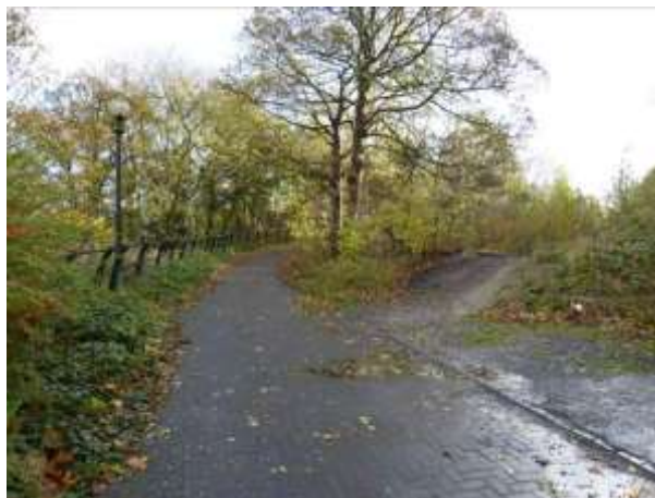
Lamp posts on Chapel Place