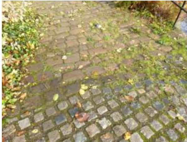
Historic cobbles and modern setts