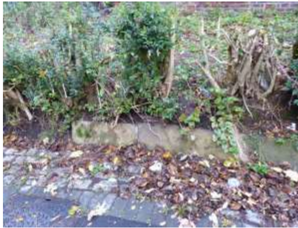
Boundary treatment in front of the derelict houses on Chapel Place