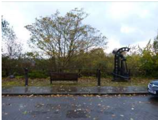
Features of an earlier public realm scheme on Old Barton Road, which are now redundant due to the overgrown embankment vegetation