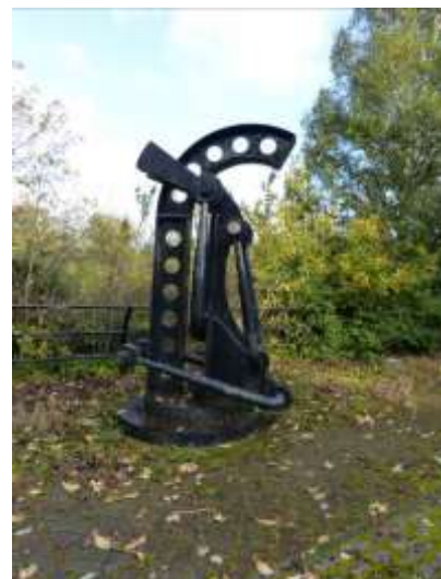
Canal-side features which should be explained in the interpretation scheme