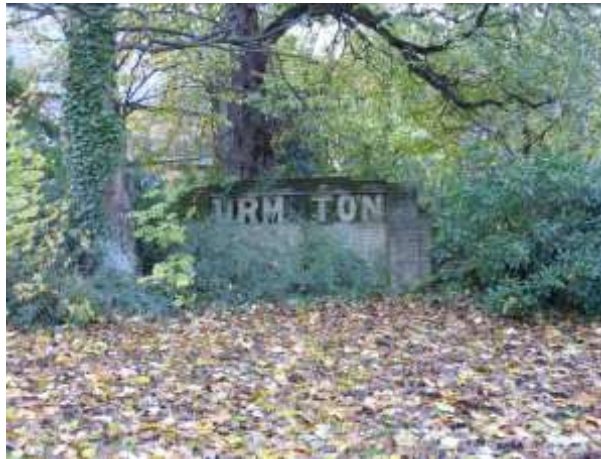
The Urmston sign, which is in need of repair