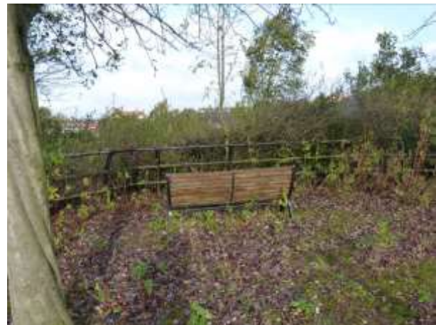
Overgrown but stylistically appropriate railings on Old Barton Road

2.3.3 There is evidence that the now-derelict houses on Chapel Place once had traditional front boundaries formed of upright slabs of roughly-hewn local masonry, which is typical of much of the Trafford area. These should be repaired and fully reinstated where possible and where there is no conflict with consented development proposals. The Redclyffe Road boundary walls of All Saints Church are of similar, roughly-hewn local masonry which is very heavily stained and would benefit from cleaning.