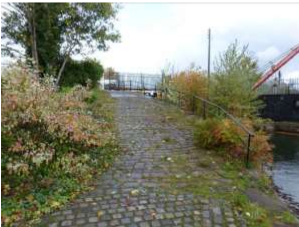
The municipal handrail along the Bridgewater Canal, with the safety fence on the far right

2.3.2 The more municipal style boundary treatments along the Bridgewater Canal – the plain black municipal handrail, white-painted bollards and standard safety fence – are incongruous and bear no relation to the boundary treatments in the western part of the Conservation Area. If possible to implement the rationalisation of a boundary treatment scheme along the two canals in particular would unify these two spaces. The railings established on the west side of Old Barton Road would be an appropriate option.