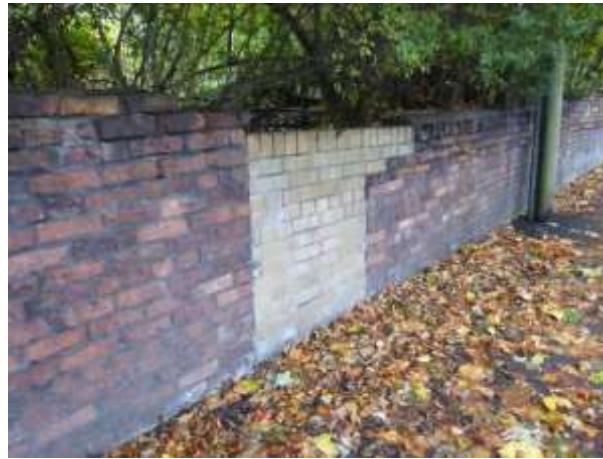
Inappropriate repairs to a historic brick boundary wall

2.3.2 The more municipal style boundary treatments along the Bridgewater Canal – the plain black municipal handrail, white-painted bollards and standard safety fence – are incongruous and bear no relation to the boundary treatments in the western part of the Conservation Area. If possible to implement the rationalisation of a boundary treatment scheme along the two canals in particular would unify these two spaces. The railings established on the west side of Old Barton Road would be an appropriate option.